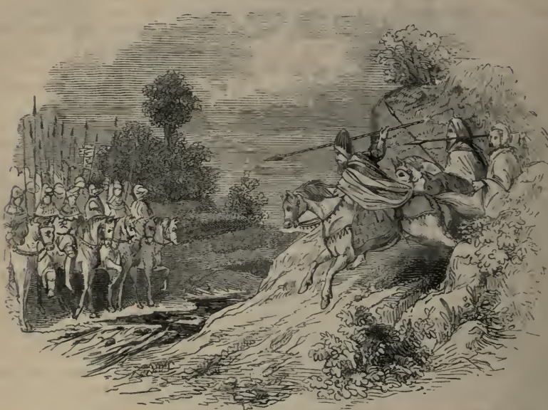
IRISH CHIEFTAINS MAKING A CHARGE. Metrical History, Harleian MSS.

“Sir William Windsor, who has longer made war in Ireland than any other English knight, has never been able, during his residence among them, to learn correctly their manners, nor the condition of the Irish people. They are a very hardy race, of great subtlety, and of various tempers, paying no attention to cleanliness, nor to any gentleman, although their country is governed by kings, of whom there are several, but seem desirous to remain in the savage state they have been brought up in. True it is, that four of the most potent kings in Ireland have submitted to the king of England, but more through love and good-humour, than by battle or force. The earl of Ormond, whose lands join their kingdoms, took great pains to induce them to go to Dublin, where the king our lord resided, and to submit themselves to him and to the crown of England. This was considered by